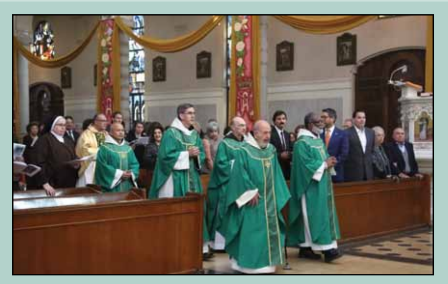
The friars process into the Basilica for Mass.