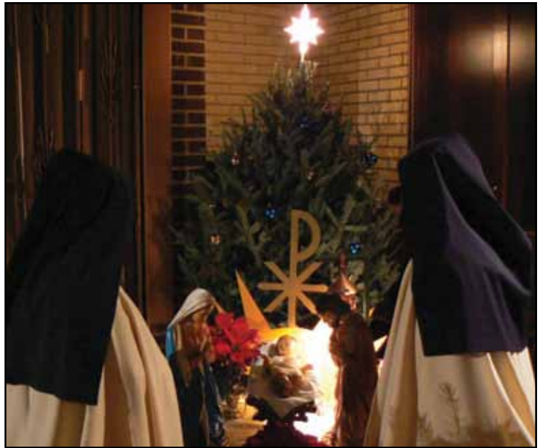
Carmelite nuns venerating the Christ child.

Soon will come the day of vengeance, this impure earth will pass through fire. [...] You will tremble, inhabitants of the earth, you will tremble on your final day. You will not be able to bear the wrath of this child, who is today the God of Love.