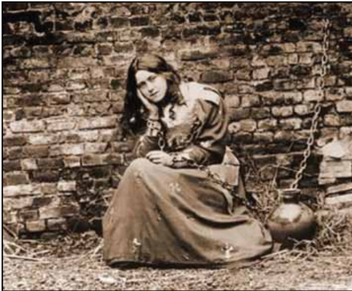
THÉRÈSE IN COSTUME AS ST. JOAN OF ARC.

GENTLE BREEZES OF CARMEL IS PUBLISHED BY ST. THÉRÈSE PROVINCE OF THE DISCALCED CARMELITE FRIARS FOR OUR FRIENDS AND BENEFACTORS.