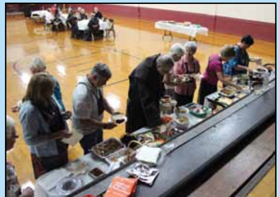
On Thursday evening of the assembly, the friars were joined by the Discalced Carmelite Seculars of San Antonio for Mass, a Holy Hour of Eucharistic adoration for vocations, and a pot luck supper.

From Sunday June 7 through Friday June 12, the Discalced Carmelite friars of the St. Thérèse Province gathered in San Antonio for their annual Provincial Assembly. The Provincial Assembly is a time for fraternity, ongoing formation, prayer and discussion. This year, the friars incorporated into the assembly another event to celebrate the fifth centenary of the birth of St. Teresa of Jesus. On Monday, June 8th, the friars were joined by some of the Discalced Carmelite nuns of the province for a day of spiritual conferences about St. Teresa, a special Mass in her honor, and, in the evening, a performance of The Interior Castle , a dramatic presentation with music by Musica Aperta . It was a week of blessings for all the friars as we spent time together in the spirit of our Holy Mother Saint Teresa.