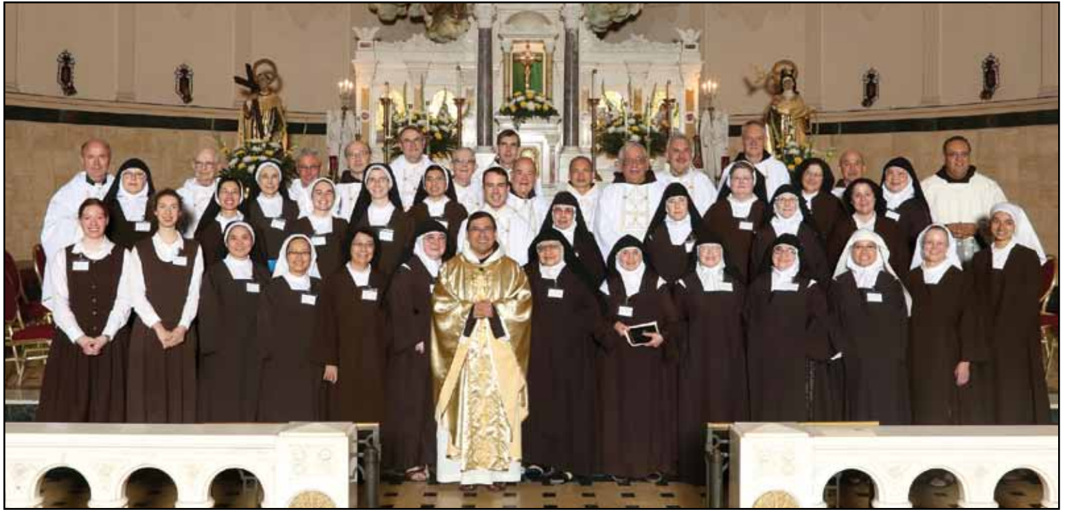
Friars and nuns at Mass celebrating Fifth Centenary of St. Teresa of Jesus' birth at Little Flower Basilica in San Antonio.