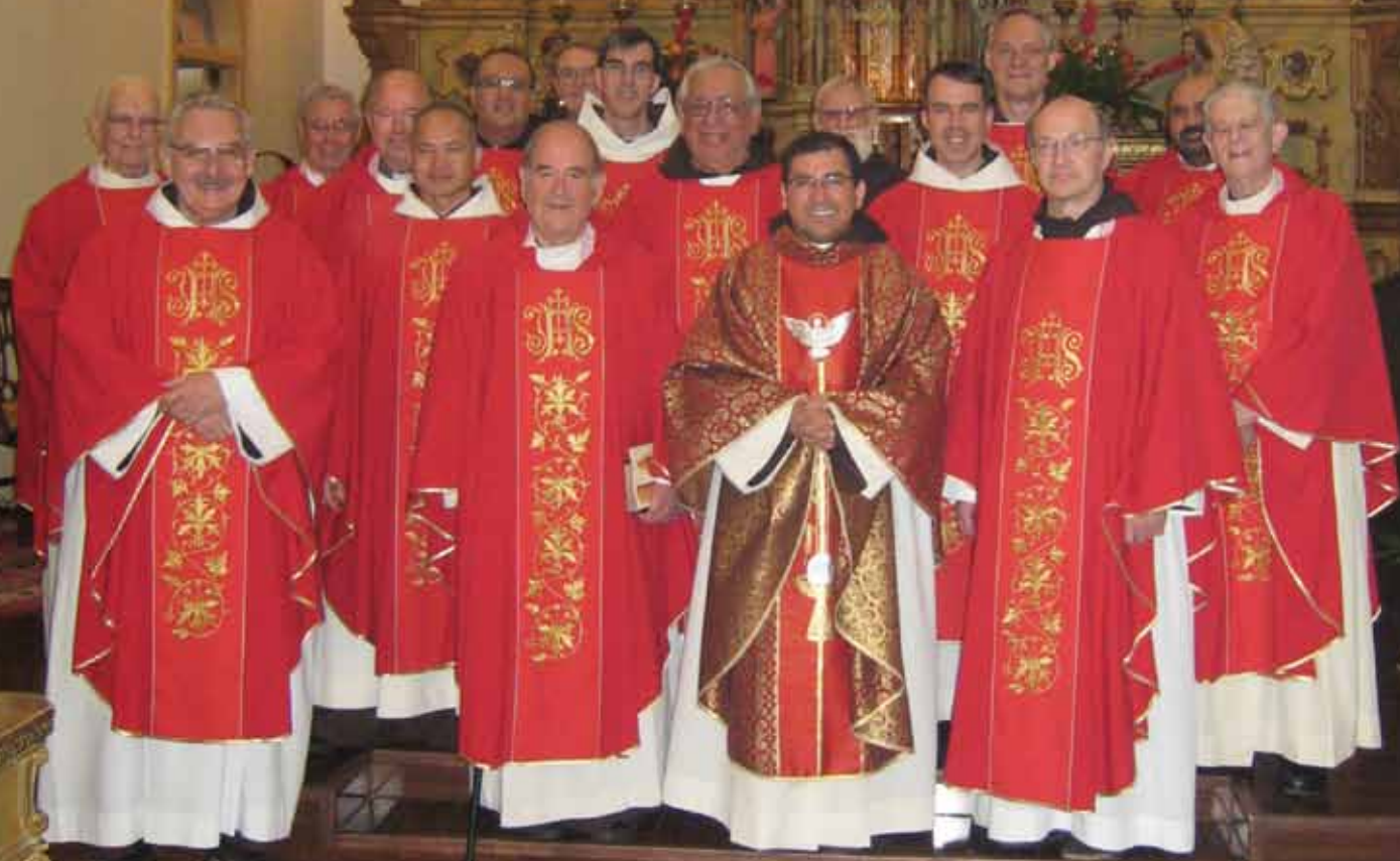
The friars of the St. Thérèse Province after the Mass of Holy Spirit. May 2014