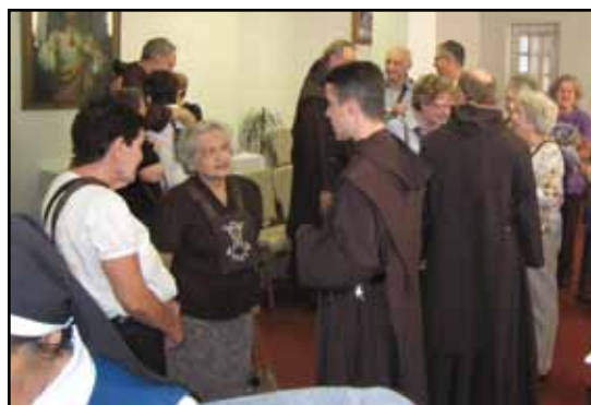
Socializing after the Centenary Mass.