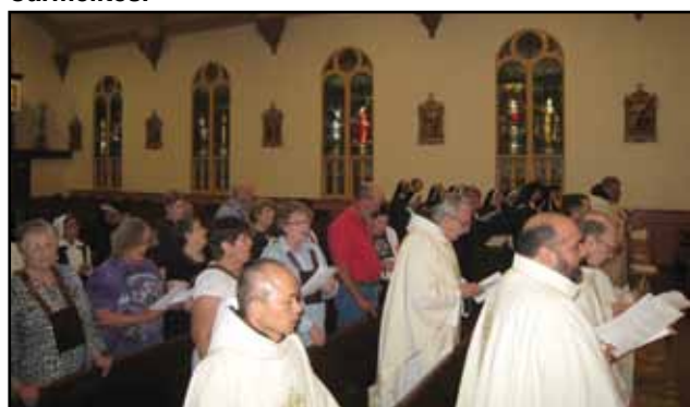
At the Mass Celebrating 100 years of the Carmelite Friars’ presence in Oklahoma.