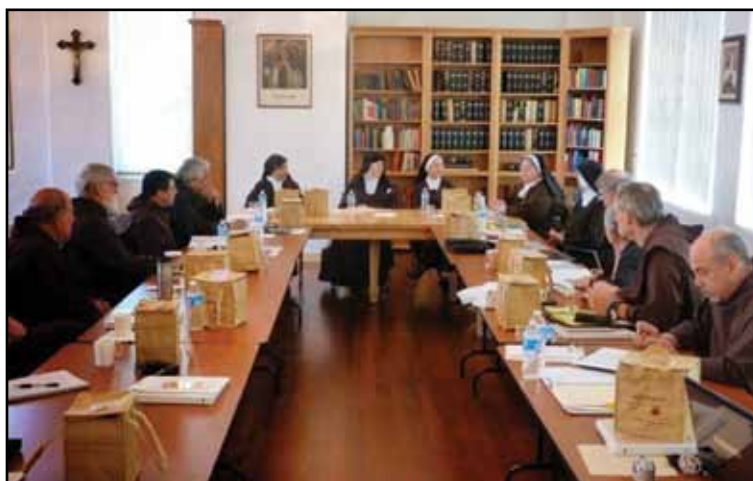
The friars hear from the Carmelite nuns during the Chapter.