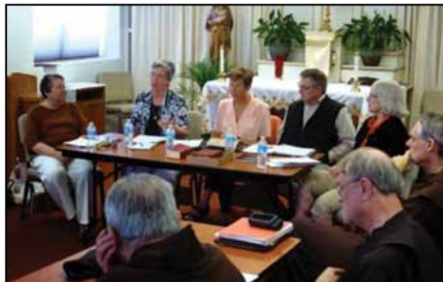
A visit from the Provincial Council of the Secular Carmelites.